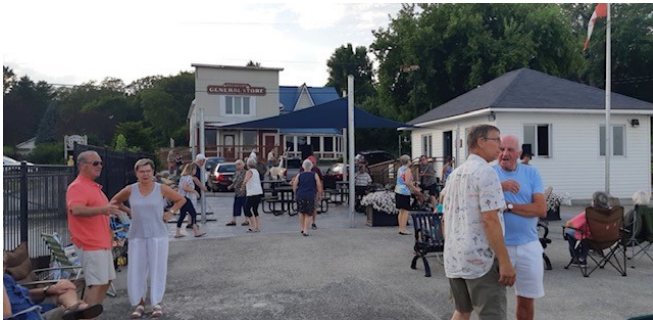
Music night at the new park

The old Rockport Customs Dock, now a town park, was a busy hub in Rockport this summer. With the floating dock installed and the shade sail in place, it was a perfect location for land and water visitors.