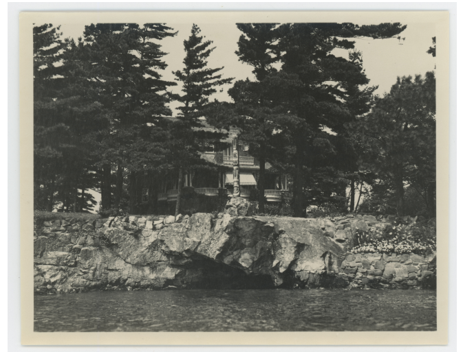
View of Totem Lodge with totem in foreground