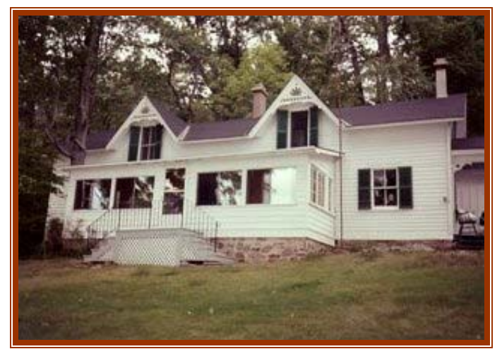
Darlingside House (Demolished in 2007)

In the end, the motion of intent to designate failed by a vote of 2 to 5. We can only hope that the owners' intentions, which are still unclear, are not as dire as they seem.