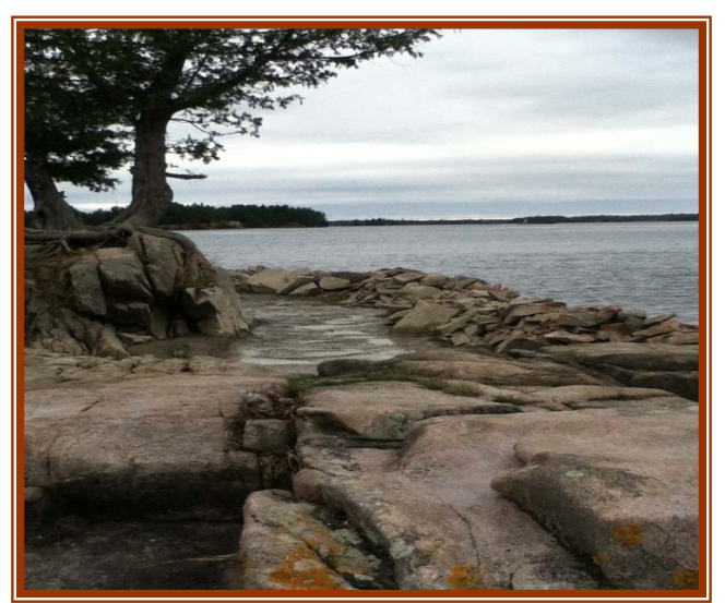
80B After Miracle Grow